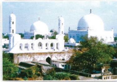
Khaja Bande Nawaz Darga