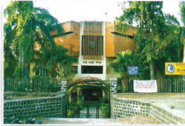
Dist. Science Centre