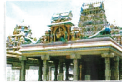
Sri Chandralamba Temple, Sannati