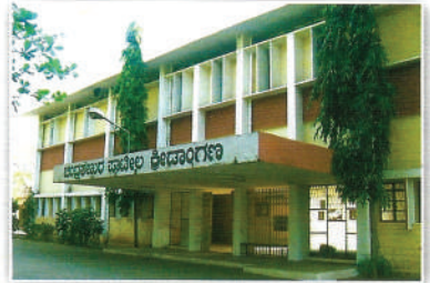
Chandrashekar Patil Stadium