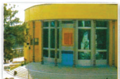
S. M. Pandit Rang Mandir