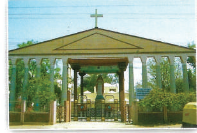
St. Mary Church