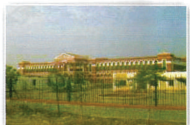
High Court Circuit bench