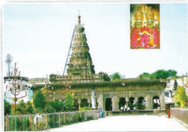
Sri Sharanabasaveshwar Temple