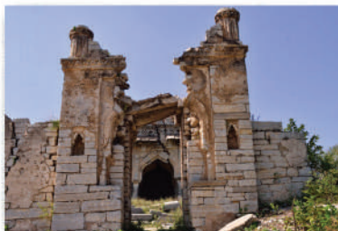
Entry to fort in Malkhed