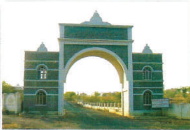
Police Training Centre