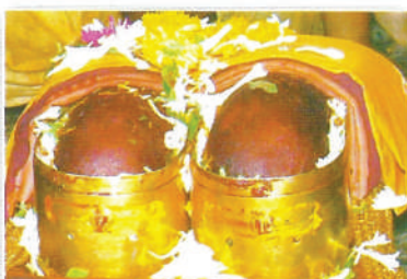
Sri Dattatreya Temple, Ghanagapur