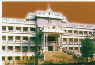
Mini Vidhan Soudha